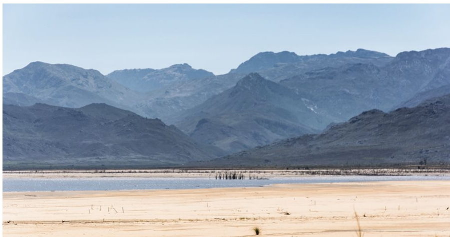
In 2018, South Africa's Western Cape experienced its worst drought in decades.

domestic usage. The government also got lucky: rain replenished its basin just in time. All in all, the drought drove at least 5.9 billion rand (approximately $400 million) in economic losses across the Western Cape.